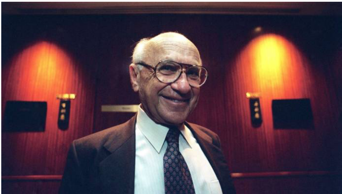
The Nobel Prize-winning economist Milton Friedman: 'There is one and only one social responsibility of business'